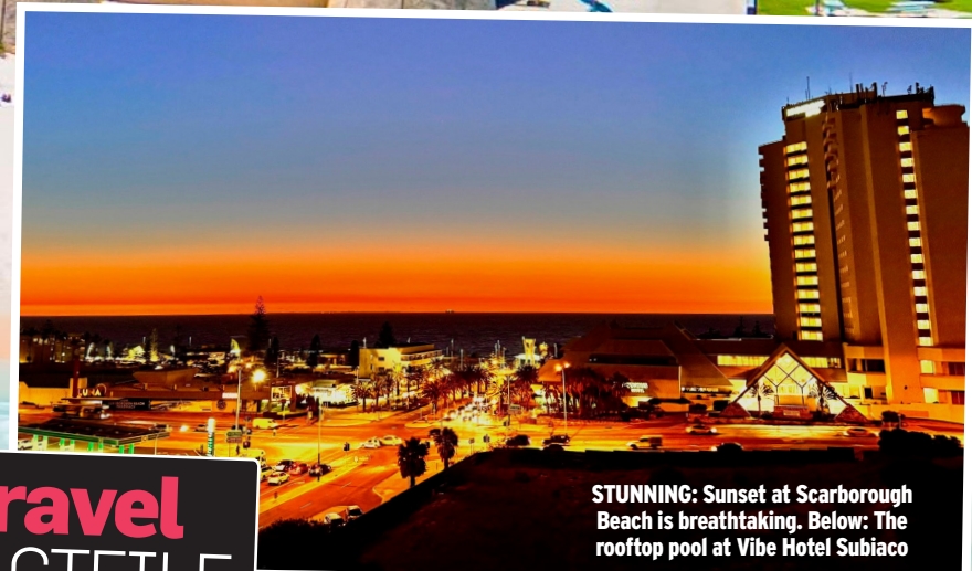
STUNNING: Sunset at Scarborough Beach is breathtaking. Below: The rooftop pool at Vibe Hotel Subiaco