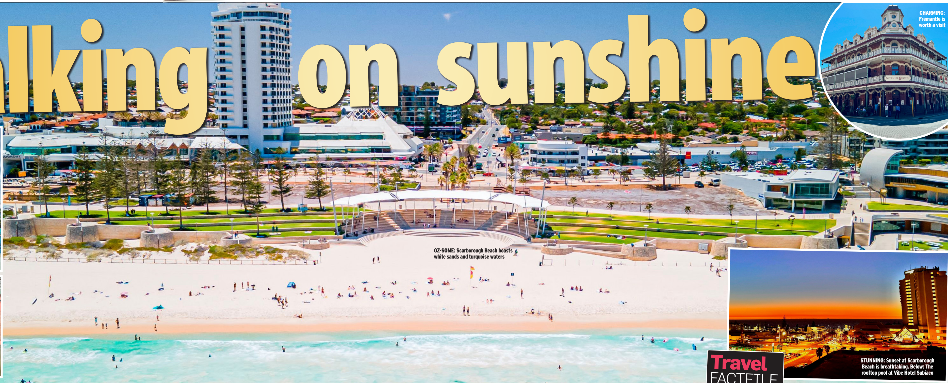
OZ-SOME: Scarborough Beach boasts white sands and turquoise waters