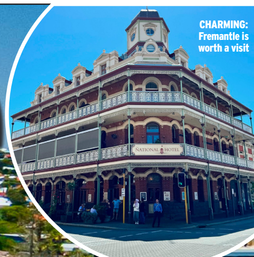
CHARMING: Fremantle is worth a visit