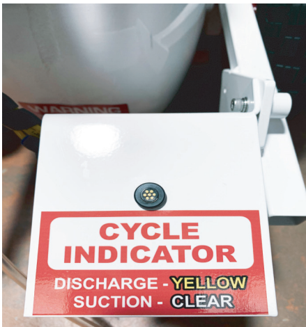
DISCHARGE CYCLE INDICATED

Note: If the pump is supplied with a head of pressure it is possible for the pump to siphon when the air supply is turned off. To prevent siphoning when the pump is not in operation, turn the pump off when it is in the discharge cycle or isolate the material supply source to the pump.