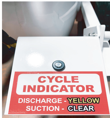
SUCTION CYCLE INDICATED