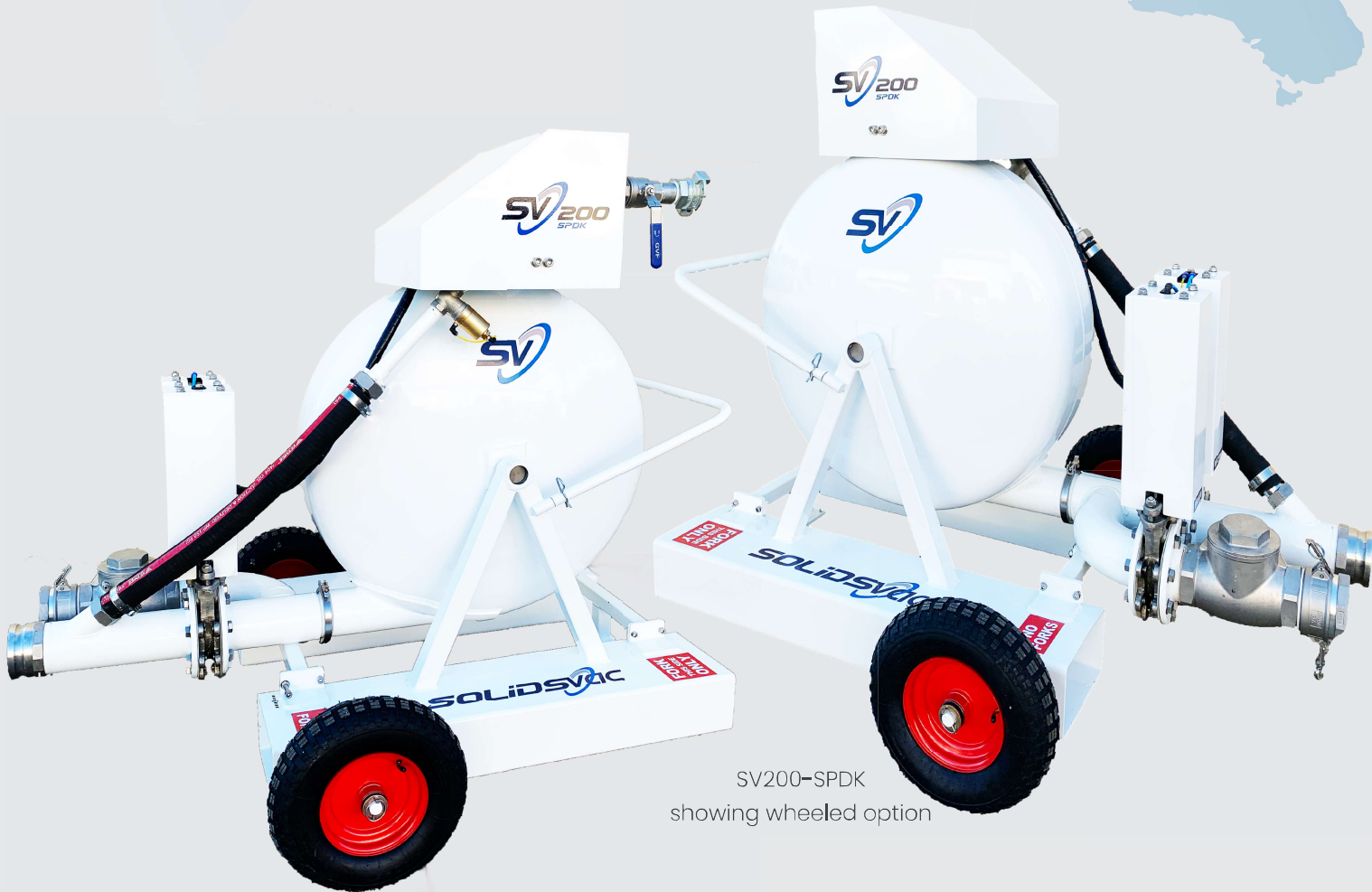
SV200-SPDK showing wheeled option