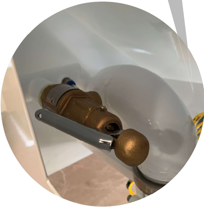
Pressure Relief Valve