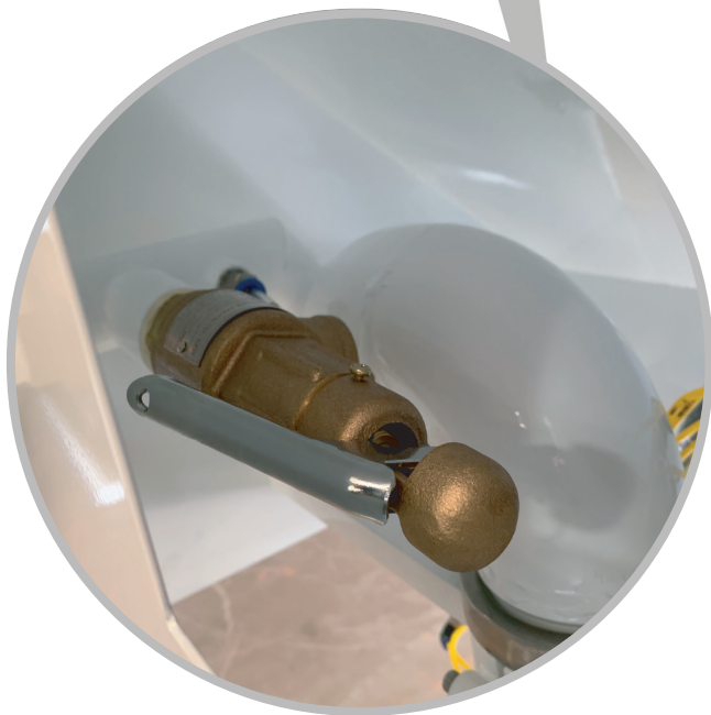
Pressure Relief Valve