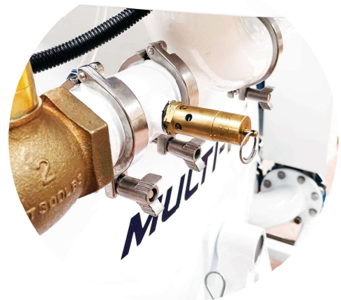
Pressure Relief Valve (PRV)

NOTE: Lubrication is not required during operation.