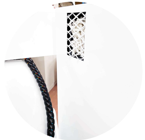
Exhaust Box Exit Vent

Hosing the exhaust box will ensure debris is free from blocking the exit vent. Blocking of the exit vent and exhaust box in general will reduce performance.