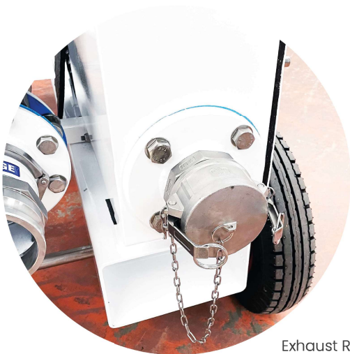
Exhaust Relief Cam-lock