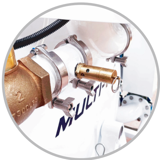
PRESSURE RELIEF VALVE (PRV)

Note: Lubrication is not required during operation.