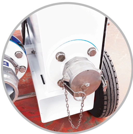
EXHAUST RELIEF CAMLOCK