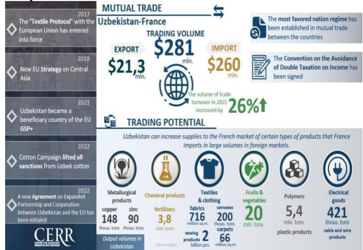
Figure 3 Infographics: Trade and economic cooperation between Uzbekistan and France

The rules for carrying out the activities of the Crypto Store have passed state registration with the Ministry of Justice of Uzbekistan. These rules determine the procedure for