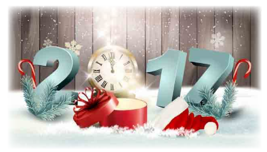
Happy New Year's Eve! - Sunday, December 31, 2017