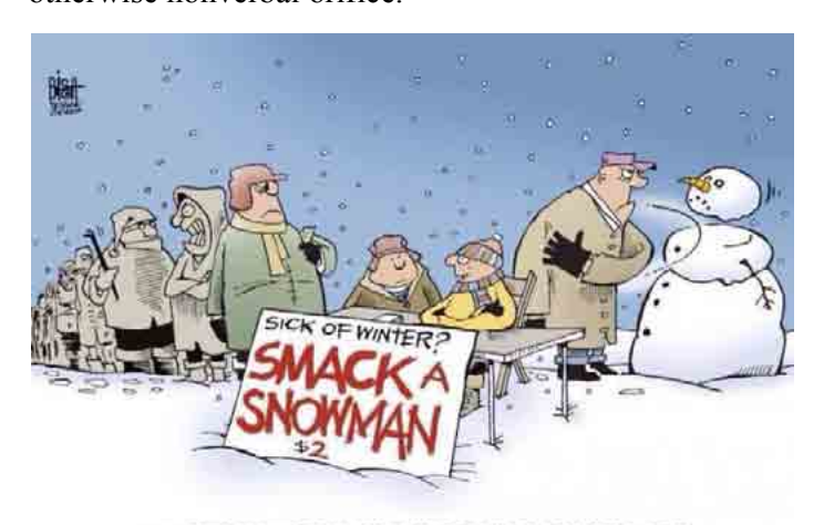
WE NEVER MADE THIS MUCH SELLING LEMONADE

Submitted by a club member whose brain is so full, he often expels Facts And Reasoned ThoughtS from an otherwise nonverbal orifice.