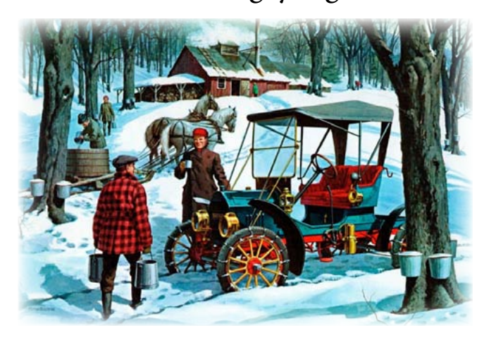
Happy New Year - 2016!