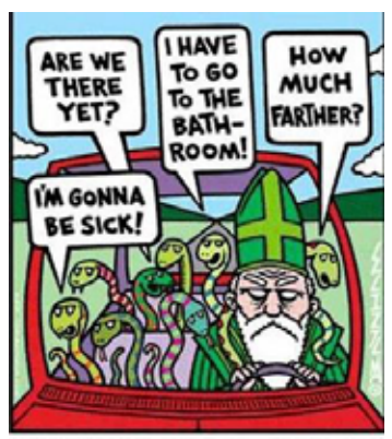
St. Patrick driving the snakes out of Ireland.