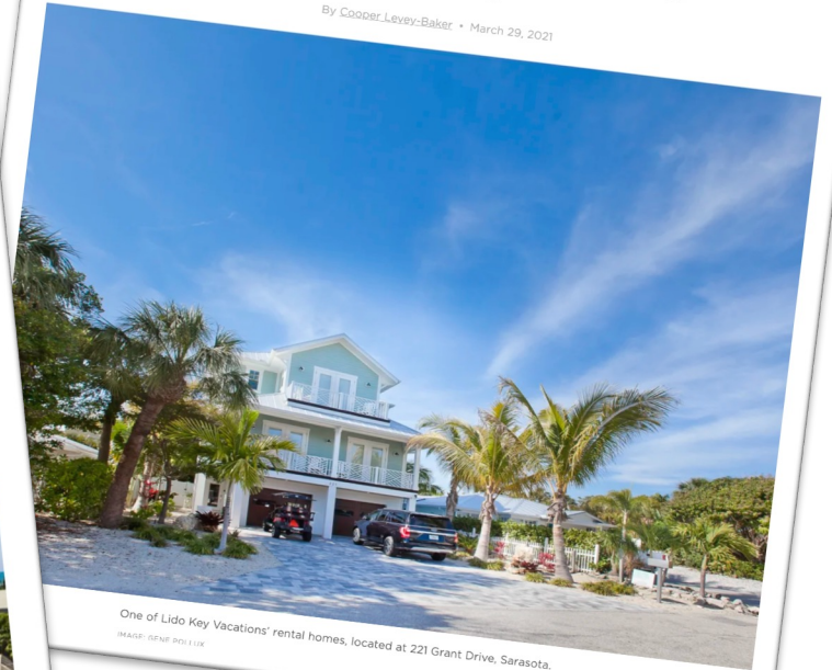
One of Lido Key Vacations' rental homes, located at 221 Grant Drive, Sarasota.