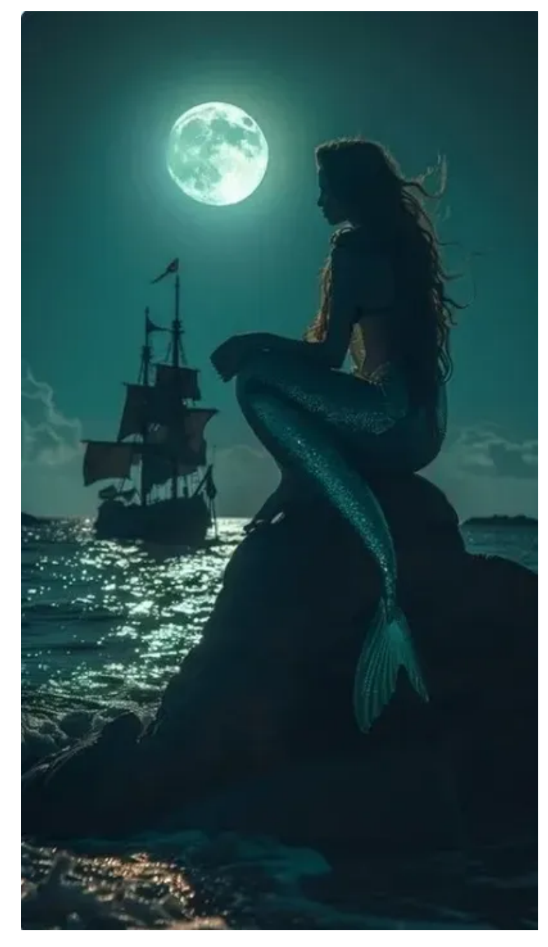
Type to enter text