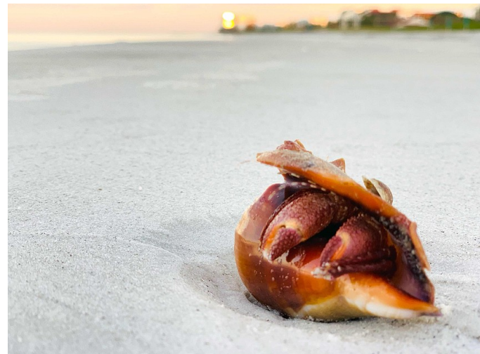
E.J. Benioni captured this photo of a crab coming out of its shell