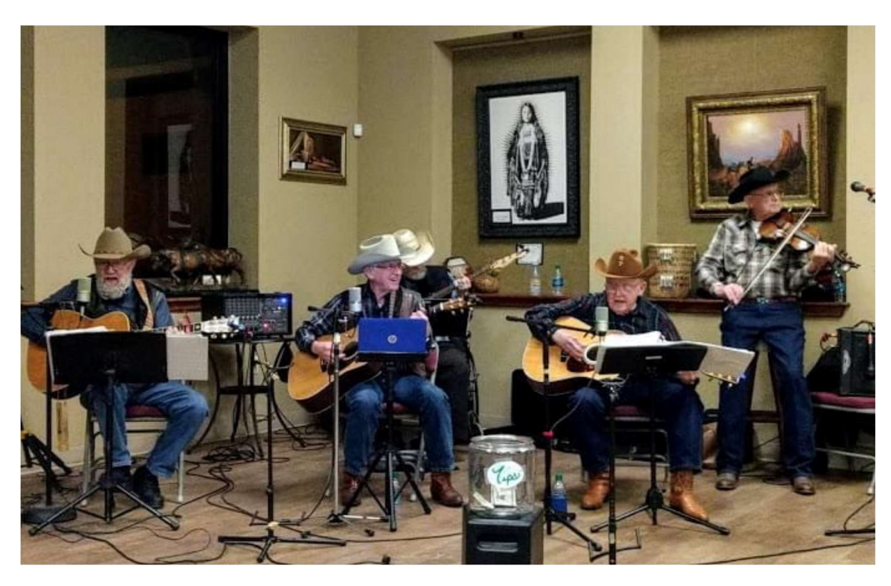
Countryfied, a Patron's Hall favorite band.

We love Patron's Hall. Patron's Hall opened October 5<sup>th</sup> for coffee, ice cream and homemade soups – yummy. We did have to cancel Open MIC and Tuesday evening "Live and Local Music" along with our Spirits Club. Finger crossed we are able to open these activities again soon.