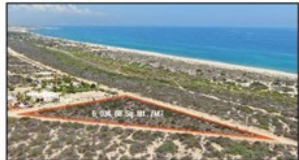
OCEAN VIEW LOT - $580,000 USD Las Lomas I, La Ribera 6,034.88 SqMt. | MLS# 22-2932