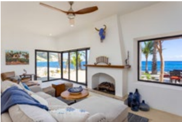
One of Neil's home shots

the beautiful locations and people of the East Cape BCS.