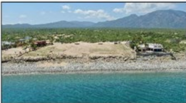
ABEL'S BEACH LOTS FROM: $249,000 USD North Los Barriles Contact Agent