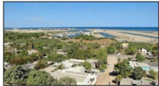
VISTA LA MARINA - $490,000 USD La Ribera 3 Bedrooms + 2 Baths. Lot: 456 Sq Mt | MLS# 22-3808