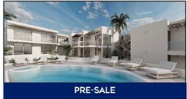
PRE-SALE SOFIA HABITAT VILLAS - FROM $185,000 USD La Ribera 6 UNITS AVAILABLE | Contact Agent