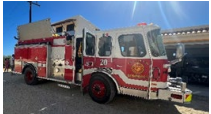
New (to us) Fire Truck!

julie@julieshipman.com www.julieshipman.com