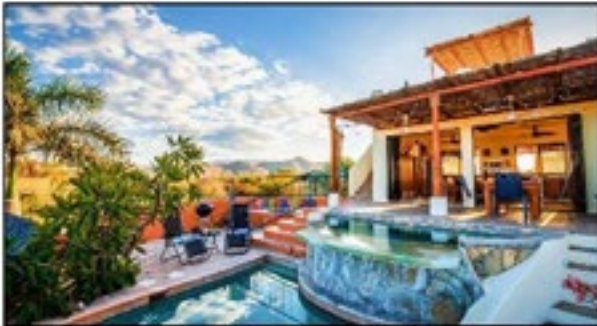
CASA SACACORCHOS - $956,000 USD San Isidro, North Los Barriles 4 Bedrooms + 4.5 Baths | MLS# 22-3702