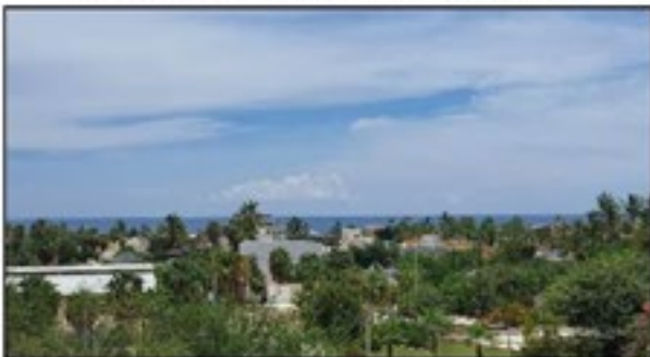
CENTRAL PARK APARTMENTS - $650,000 USD Los Barriles 2 buildings, 6 units | MLS# 22-3760