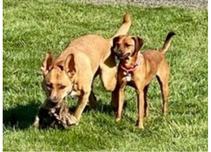
Penny and Chase at play

Tag is her favorite game, and she will often play whether you know you are in the game or not. Penny wants to go with us whenever we get ready for a car ride. Penny has taken to my son as her person. He is helping her to continue to grow, getting her out of her nervous shell and being a good alpha for her. When he is out riding his dirt bike Penny runs with him and keeps a close eye on her boy. She is very vocal and 'talks' back all the time. She makes funny grumble sounds that sound like she is muttering under her breath.