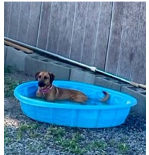
Cooling off this summer