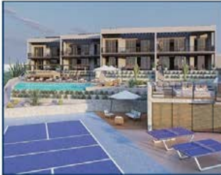
Villas Miramar Los Barriles from $445,000 USD