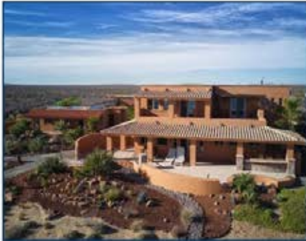
Surfer's Paradise San Juanico, Pacific, $1,450,000 USD