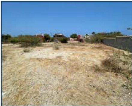
Pam's Lot at $189,000 USD