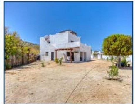
Casa Mira at $520,000 USD

Information for other properties in our area is available and can be shown by our Sales Agents at your request.