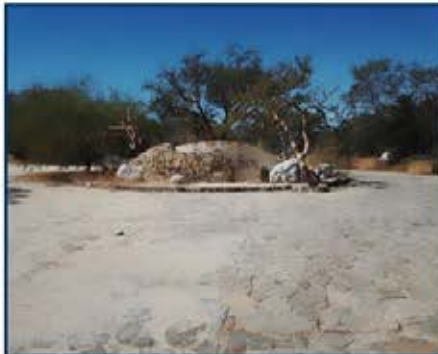
Lots in Colinas del Sol S/N at $67,500 USD