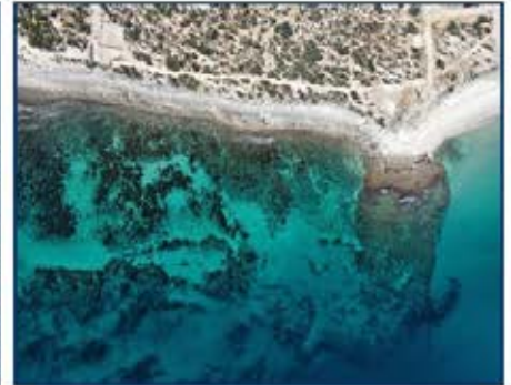
Las tinas Beach Parcel at $1,250,000 USD