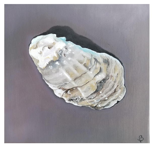
"Inside, Outside" by Brook Penick with permission of the artist.