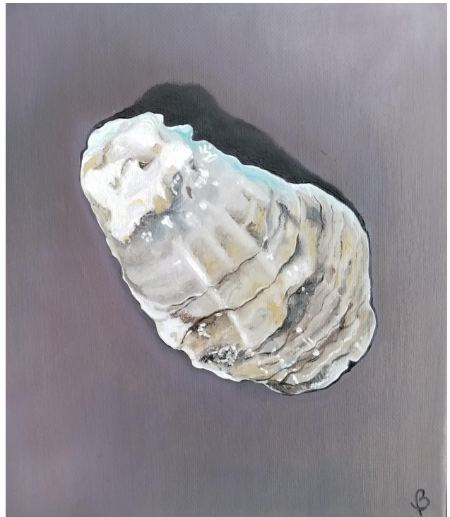
“Inside, Outside” by Brook Penick with permission of the artist ☺