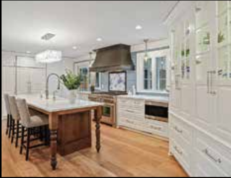
374 Ferndale Rd W | Wayzata 3 Bed/3 Bath | $2,500,000