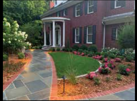
205 Black Oaks Ln N | Plymouth Lakefront Home | $3,950,000

Call Beth Ulrich For Your Next Real Estate Move