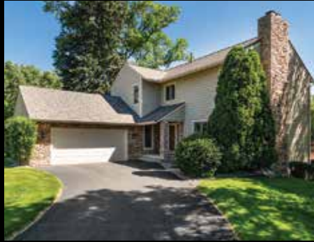
12360 45th Place N | Plymouth 4 Bed/4 Bath | $570,000