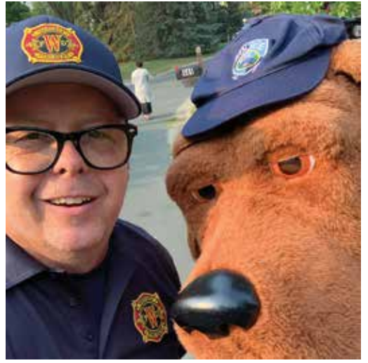
McGruff, Night to Unite 2021