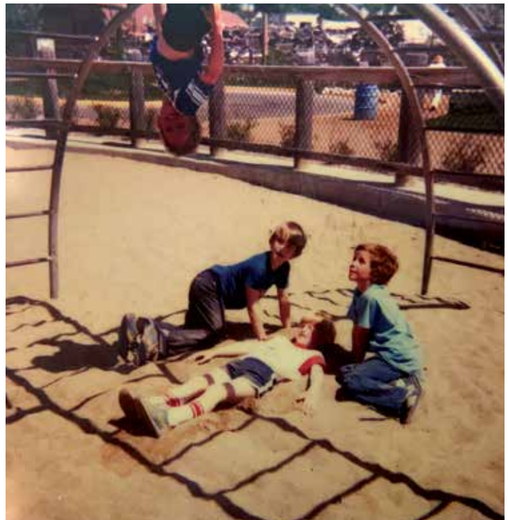
A couple photos from my family album of Wayzata Beach in the 1980's. Pictured above is the notorious "Splinter Maker". You could burn yourself on the slide and hide in the shade to cool off..all the while playing chase games with your friends. You can see me dangling above my friends on the monkey bar gym.

"Won't be long til summer time is through, not for us now." – All Summer Long, Beach Boys