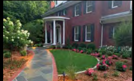
205 Black Oaks Ln N | Plymouth Lakefront Home | $3,950,000

Call Beth Ulrich For Your Next Real Estate Move