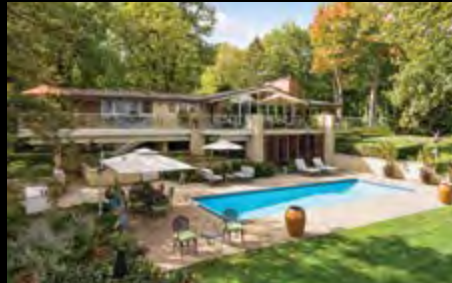
2605 Maple Ridge Lane | Excelsior $4,250,000