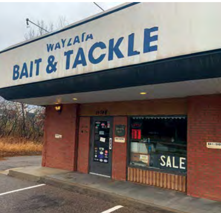
Left side images, top to bottom: Polaroids of Customers’ Catches Brothers Bob and Tim Sonenstahl

“We’re here until the bulldozers show up,” said Sonenstahl.