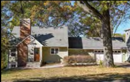
207 Benton Avenue | Wayzata 3 Bed/4 Bath | $1,300,000