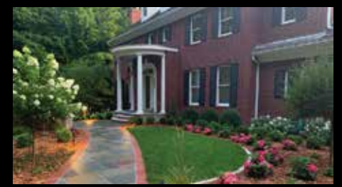
205 Black Oaks Lane North | Plymouth Lakefront Home | $3,795,000