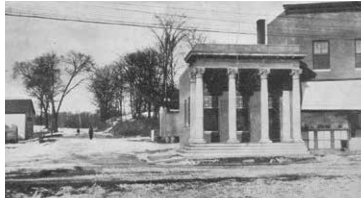
Wayzata State Bank, early 1900s