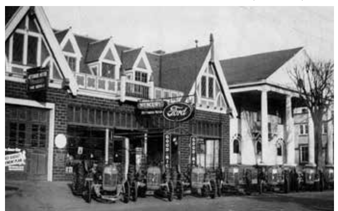
Rettinger Motor Company, circa 1920