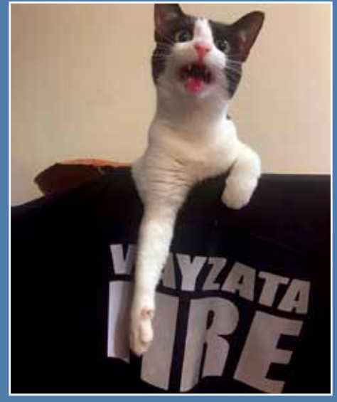
Alice is a two-year-old cat with a ton of personality. She insists she should be the Wayzata Fire Department's mascot. She loves all the bird watching Wayzata offers. Owner, The Editor of this magazine!

friends around town. Do you know of a picture perfectpet?Emailapicto:nate@wayzatatogether.com