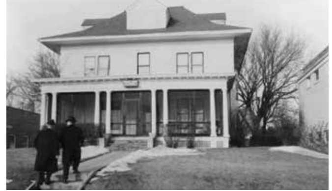
Minnetonka Hospital circa 1930