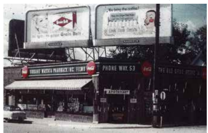
Wayzata Pharmacy, circa 1960