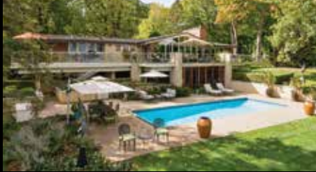
2605 Maple Ridge Lane | Excelsior $4,100,000