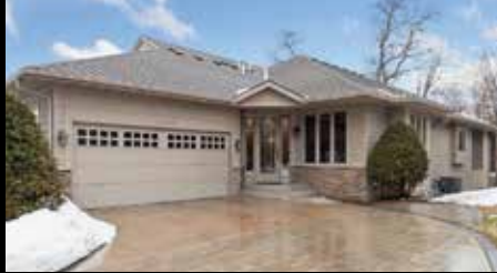
17530 Sanctuary Drive | Wayzata $835,000