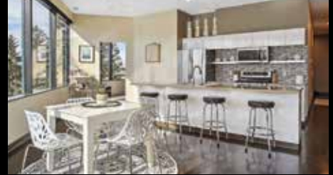
5601 Smetana Dr #204 | Minnetonka 2 Bed/2 Bath | $350,000

Reach out to us today if you'd like to chat about your next real estate move!