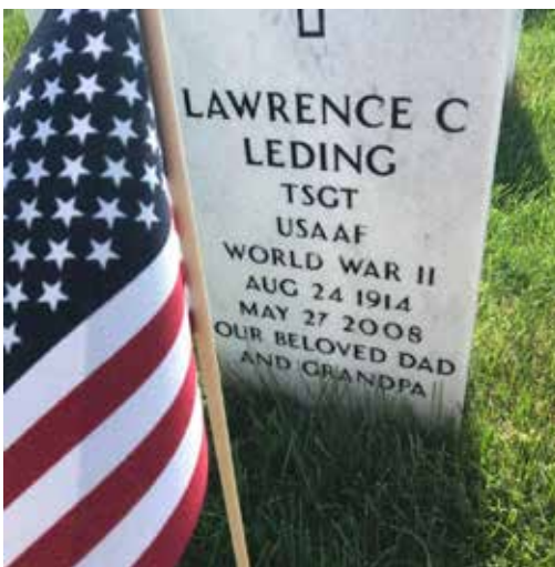
My Grandfather's marker at Fort Snelling National Cemetery in St. Paul