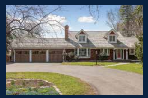
374 Ferndale Rd W / Wayzata 3 Bed/3 Bath / $2,600,000