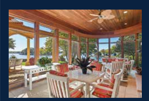
3960 Walden Shores Rd / Deephaven 11,000+ sq ft / $7,250,000