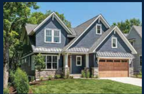
124 Chicago Ave N / Wayzata Custom Build with Regency Homes $1,750,000