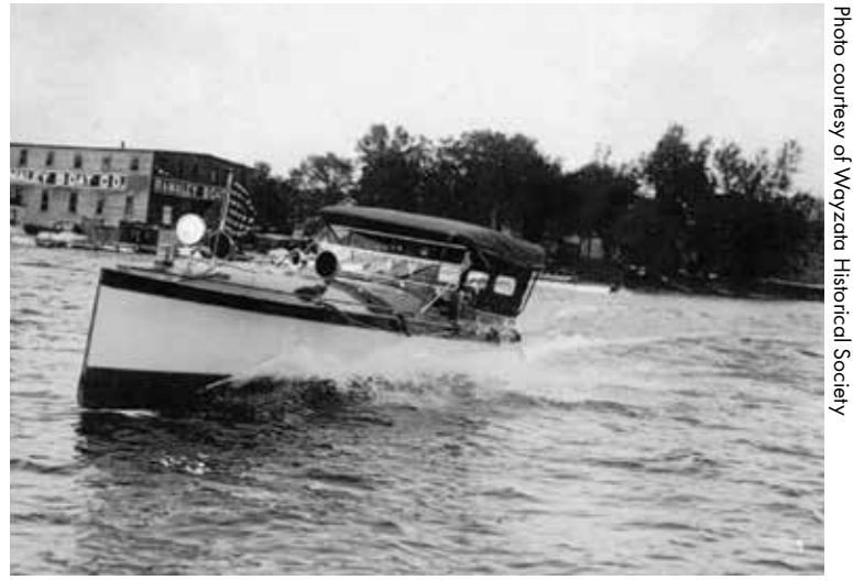
The "Rondivalla" motorboat with Ramaley Boats in the background, circa 1910