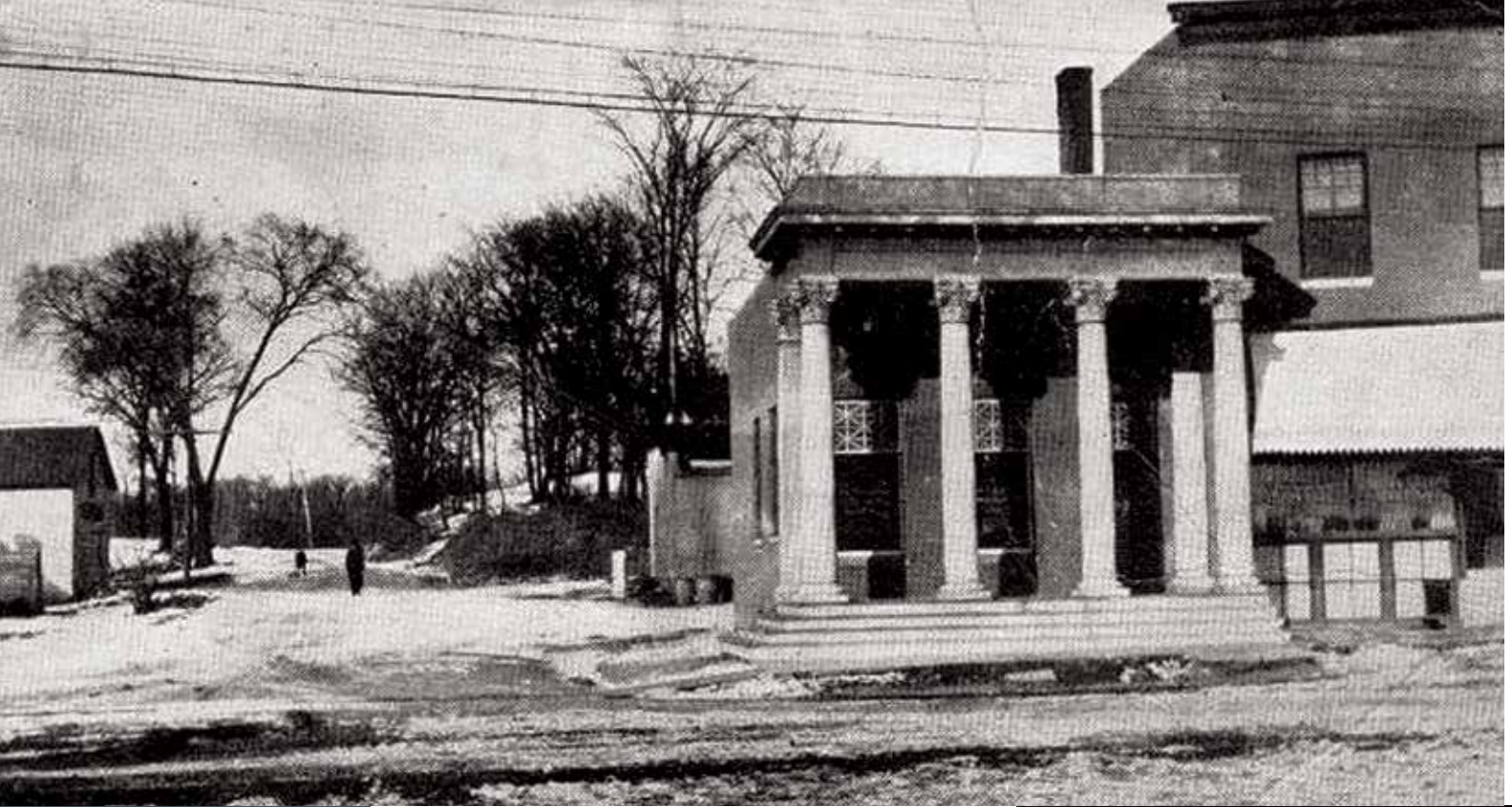
Wayzata State Bank 1909. Building to the right is Pettitt & Kysor, a grocery store.