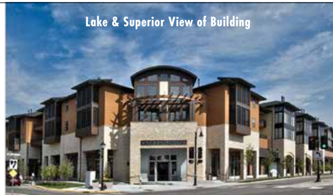
Lake & Superior View of Building