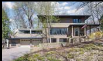
243 Bushaway Road Wayzata 5 Bed/3 Bath | $739,000