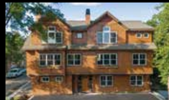
220 School Ave, Excelsior #200 #300 2 Bed/3 Bath 3 Bed/3 Bath $1,150,000 $1,450,000

Reach out to us today if you'd like to chat about your next real estate move!