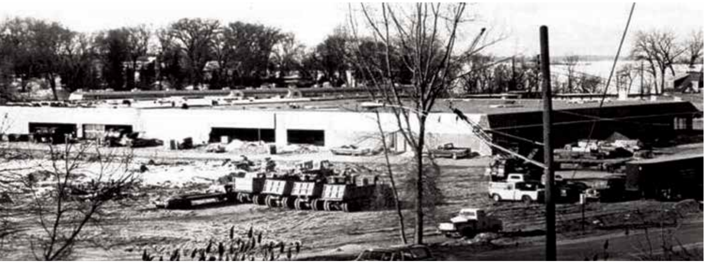
Construction in progress, mid 1960s