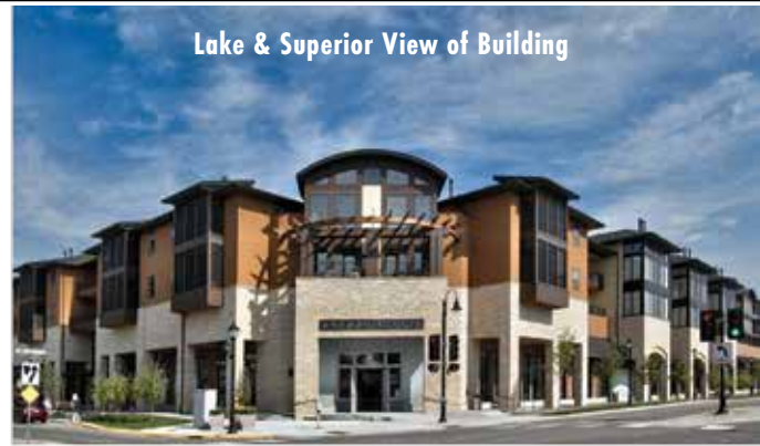
Lake & Superior View of Building