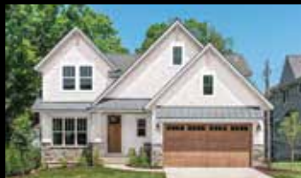
124 Chicago Ave N Wayzata Lot Size: .21 | Pkgs Starting at $1.8