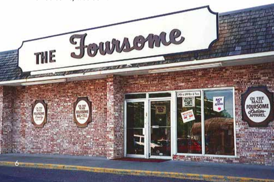
The Foursome’s outside entrance at the Wayzata Bay Center in the 1970s