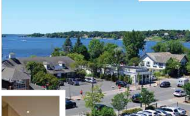
View of Wayzata & Lake Minnetonka

Live just blocks away from Lake Minnetonka and enjoy all the activities this lake town has to offer. A wide variety of restaurants and premier shopping right outside your door. The feel of the big city with a small town vibe that exceeds all your expectations.