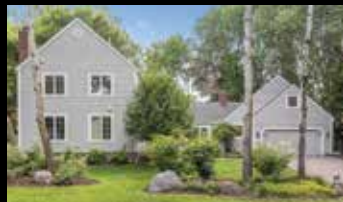
14711 Stone Road Minnetonka 4 Bed/5 Bath | $1,100,000