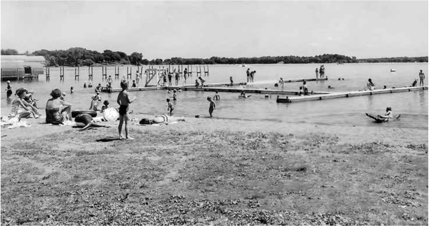
The swimming beach on Wayzata Bay.