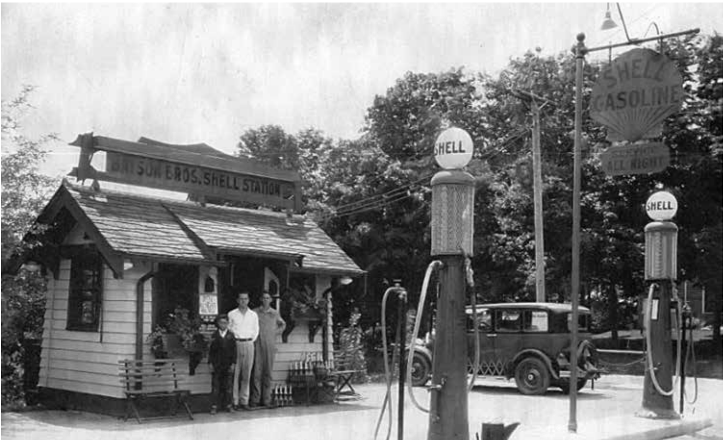
Batson Bros. Shell Station, circa 1930's