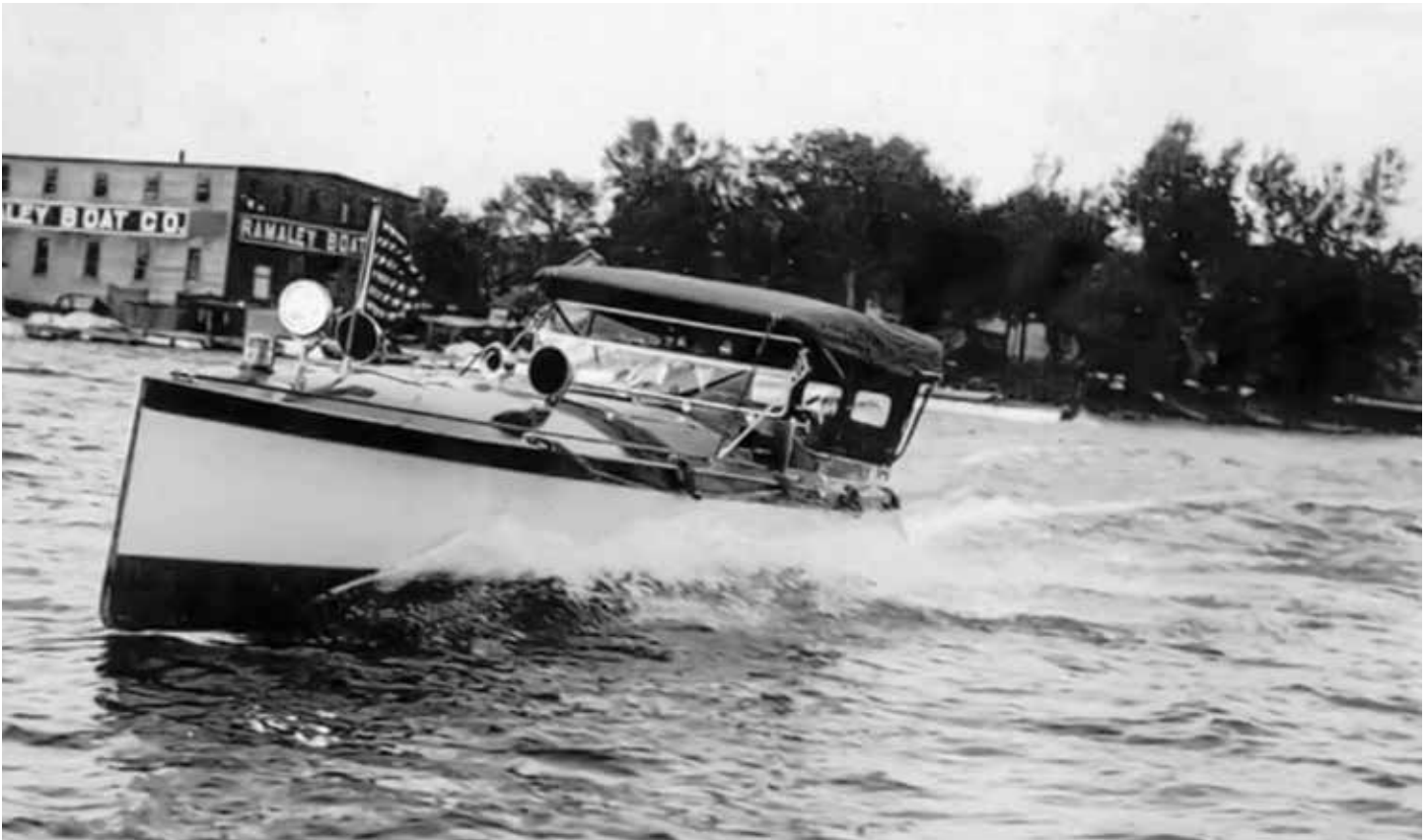
The "Rondivalla" motorboat on Wayzata Bay with Ramaley Boat Works in the Background, c. 1910