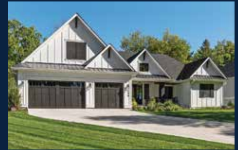
Photo represents similar house to be built.

249 Chicago Ave N / Wayzata Build Package $1.9M+