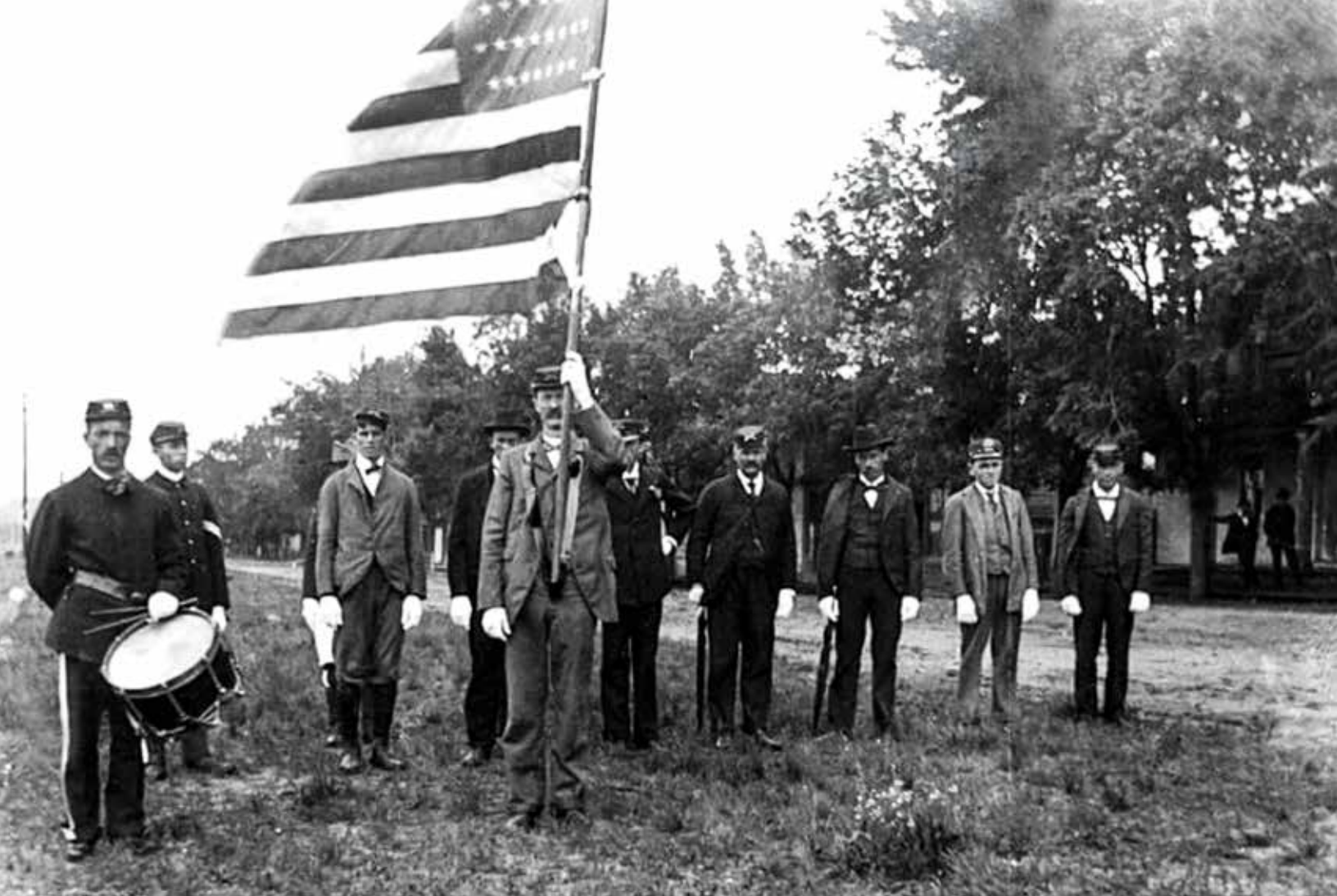
Civil War Veterans in Wayzata, c. 1880