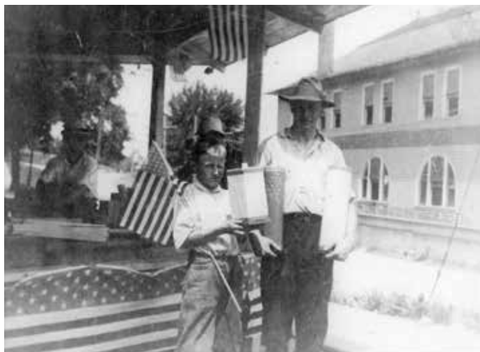
Image left: Fireworks stand, c. 1920 Lake & Water St, Excelsior

Whatever your July 4th plans are, I guarantee they look different than they did years ago.