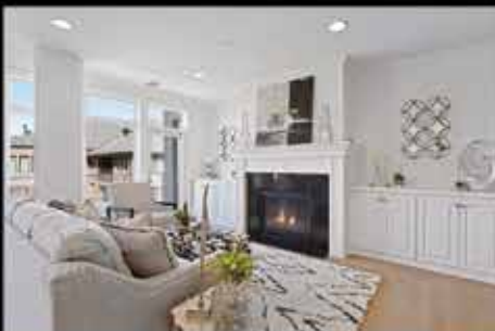
875 Lake St N #302 | Wayzata 2 Bed/2 Bath | $995,000