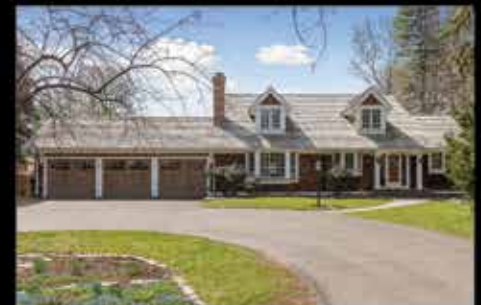
374 Ferndale Rd W | Wayzata 3 Bed/3 Bath | $2,600,000