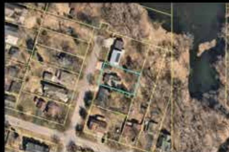
224 Chicago Ave N | Wayzata Building Packages Starting at $1.9 4 Other Lots in Wayzata Available