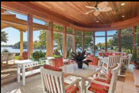
3960 Walden Shores Rd | Deephaven 11,000+ sq ft | $7,250,000