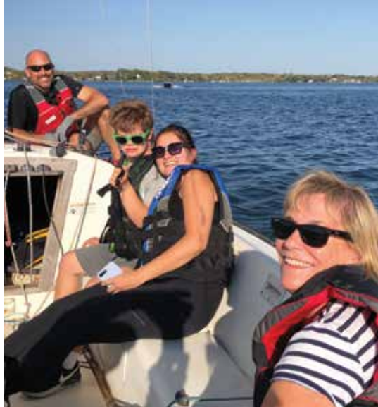
Enjoying a beautiful day on Lake Minnetonka.