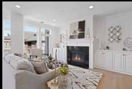
875 Lake St N #302 | Wayzata 2 Bed/2 Bath | $995,000