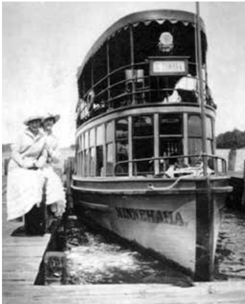
Ladies pose by one of the express boats, the Minnehaha, at the Wayzata Dock, Lake Minnetonka

A 1500-seat music venue was a big hit with adults. These boats were not idle during the week. They were crucial for getting Lake Minnetonka residents to and from work in Minneapolis. You see, back then, navigating around Lake Minnetonka was not as efficient and smooth as it is today.