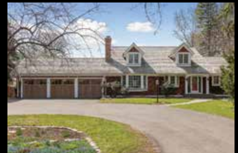
374 Ferndale Rd W | Wayzata 3 Bed/3 Bath | $2,600,000