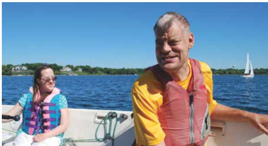
Taking control and enjoying the sights Lake Minnetonka offers.

Wayzata is a giving community. Looking to volunteer? Wayzata Sailing is the perfect place to do that. Wayzata Sailing's goal is to provide lake access, learning, and adventure to all, primarily through the sport of sailing. Don't have time right now, but still want to help? Wayzata Sailing asks that those who are able to support financially do so, in the range that works for you. wayzatasailing.org/programs/adaptive to learn more.