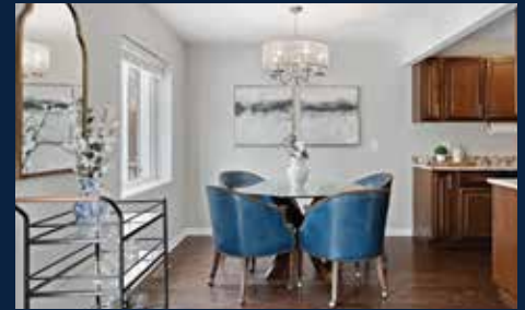
444 Pondridge Circle / Wayzata 3 Beds/3 Baths / $349,000

Incredible corner lot with open kitchen/living room layout. Wood burning fireplace and great natural light. Three bedrooms on the main floor with bathroom. Lower level holds second living room and another bathroom. One car garage attached.