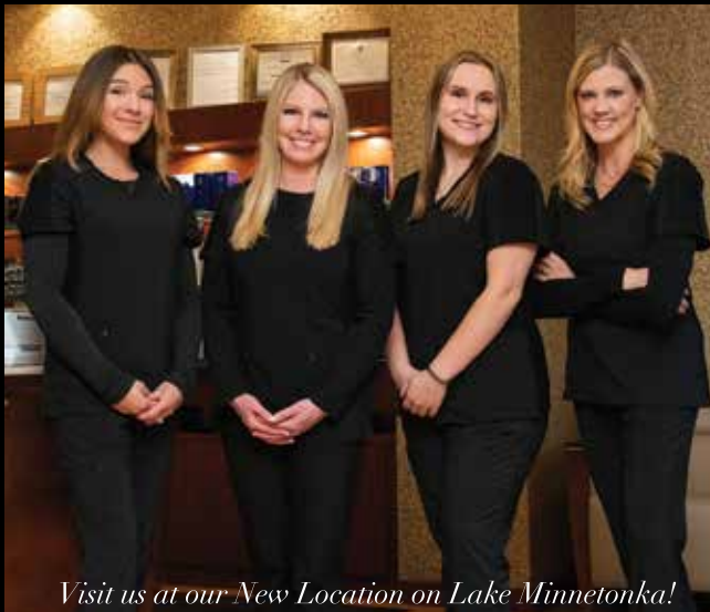
Visit us at our New Location on Lake Minnetonka!