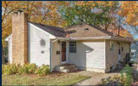
607 Gardner Street / Wayzata 3 Beds/2 Baths / $650,000

Keith Waters built home with breathtaking panoramic views. This southwest facing beauty looks out at the Minnetonka Yacht Club, Carson Bay and St. Louis Bay. Truly an entertainer's dream home!