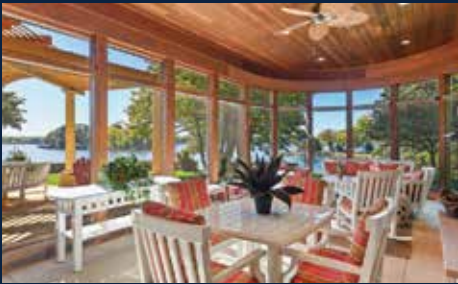
3960 Walden Shores Rd / Deephaven 11,000+ sq ft / $7,250,000