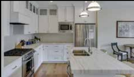
875 Lake St N, #320 | Wayzata 1 Bed/2 Bath | $845,000

Enjoy single level, no maintenance living, right in downtown Wayzata!