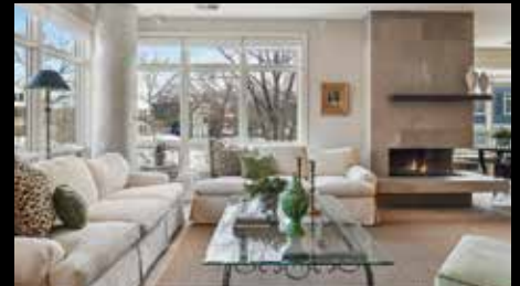
875 Lake St N, #213 | Wayzata 3 Bed/3 Bath | $2,200,000

Reach out to us today if you'd like to chat about your next real estate move!