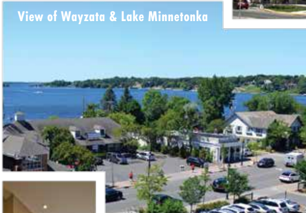
View of Wayzata & Lake Minnetonka

Live just blocks away from Lake Minnetonka and enjoy all the activities this lake town has to offer. A wide variety of restaurants and premier shopping right outside your door. The feel of the big city with a small town vibe that exceeds all your expectations.