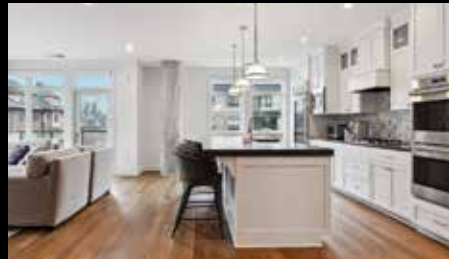
875 Lake St N, #321 | Wayzata 3 Bed/3 Bath | $1,800,000