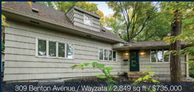
309 Benton Avenue / Wayzata / 2,849 sq ft / $735,000