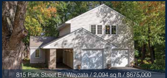
815 Park Street E / Wayzata / 2,094 sq ft / $675,000