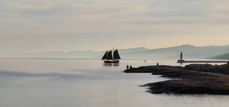
Below: Grand Marais, MN Saw tooth mountains in the background. The light house marks the entrance to the Grand Marais Harbor. The sailboat is a double masted sailboat is called Hjordis. It's a traditionally rigged 50' steel schooner that gives short rides to tourists.