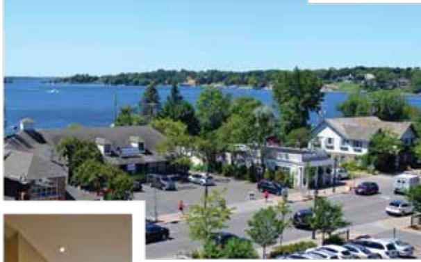
View of Wayzata & Lake Minnetonka

Live just blocks away from Lake Minnetonka and enjoy all the activities this lake town has to offer. A wide variety of restaurants and premier shopping right outside your door. The feel of the big city with a small town vibe that exceeds all your expectations.