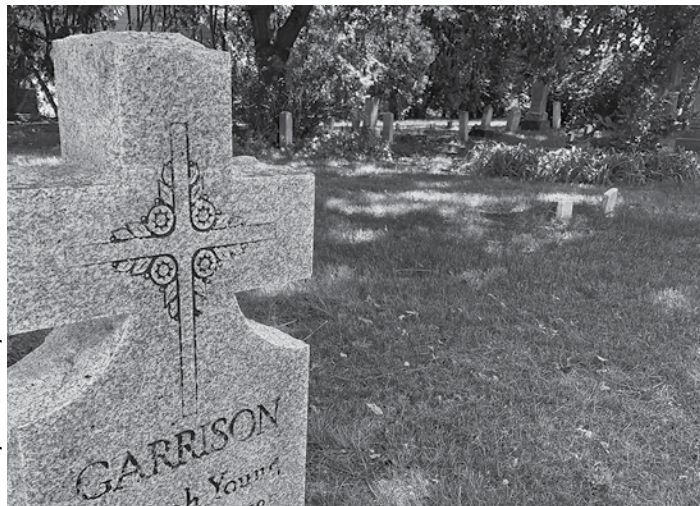
Old Wayzata Cemetery

Three Wayzata cemeteries paint a picture from the city's origins to its present day. A visit to these grounds is a stroll through history.