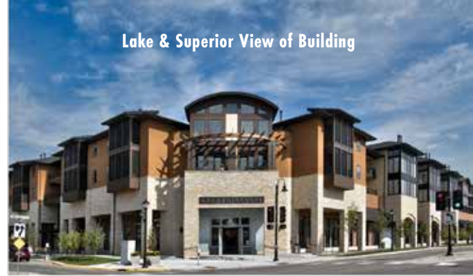
Lake & Superior View of Building