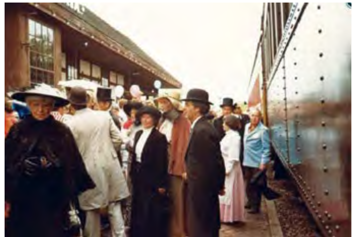
A crowd dressed up in early 1900s attire at 1981's JJ Hill Days.

Since 1975, JJ Hill Days has been a must-attend event. When you go to this year's event, you'll understand the rich history that made it what it is today.