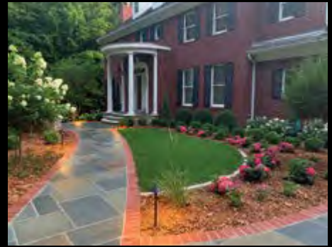
205 Black Oaks Ln N | Plymouth Lakefront Home | $3,950,000

Call Beth Ulrich For Your Next Real Estate Move