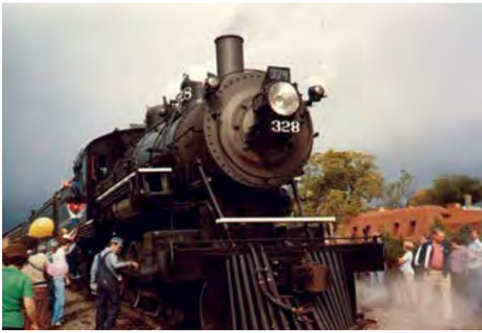
A steam locomotive on display at 1981's JJ Hill Days. That year's celebration marked 75 years since the depot was built.

James J. Hill Days is upon us once again. And as important as it is to remember who Hill was and the impact he had on Wayzata, it's also important to remember the history of Wayzata's famous festival.