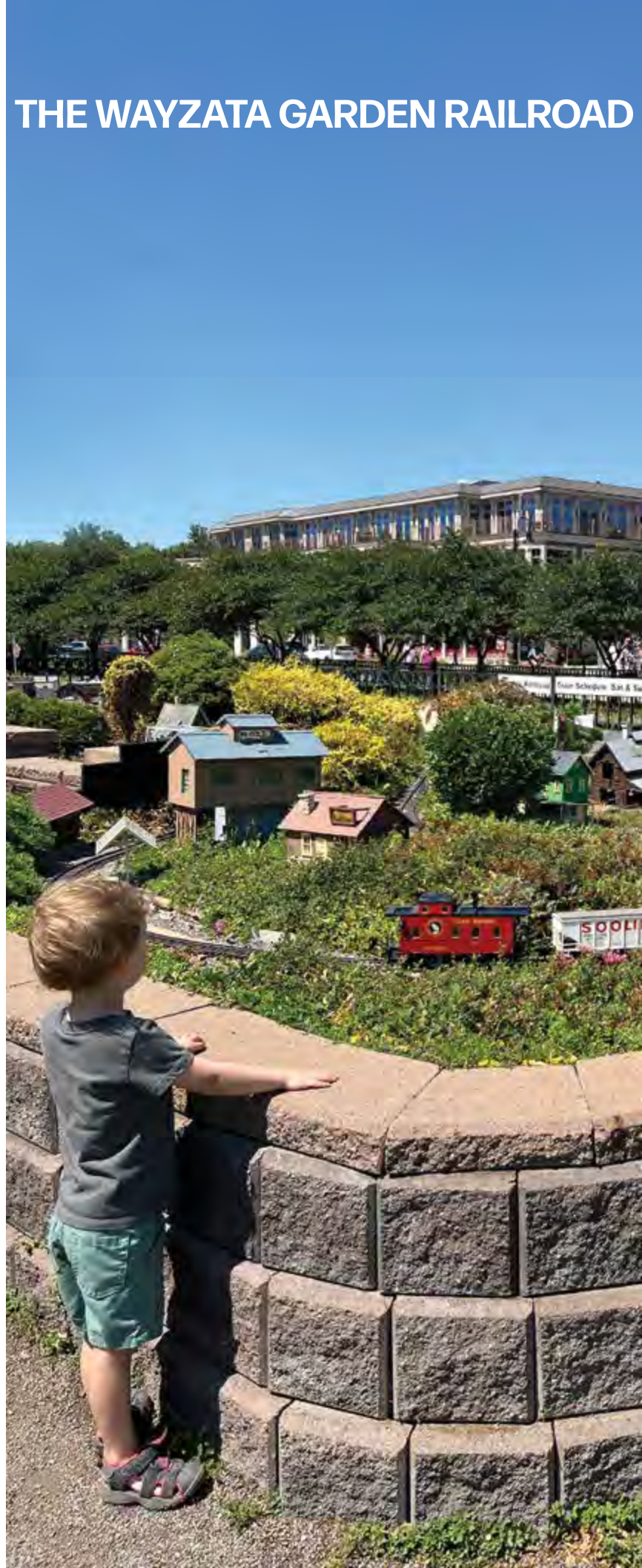
Children chase the train around the tracks on a sunny Saturday at the Depot.

And as you watch the trains travel down the tracks, you can imagine what life might have been like here in Wayzata many decades ago.