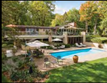
2605 Maple Ridge Lane | Excelsior $4,500,000