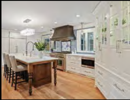
374 Ferndale Rd W | Wayzata 3 Bed/3 Bath | $2,500,000