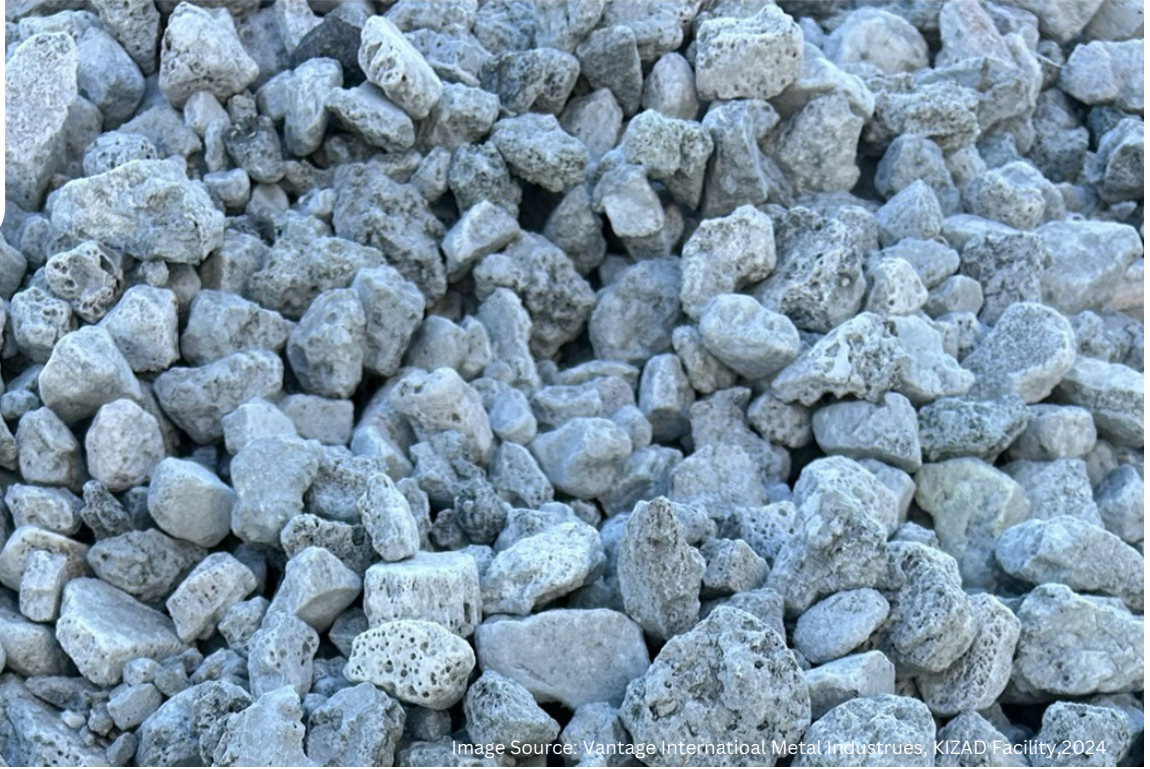
Image Source: Vantage International Metal Industries, KIZAD Facility, 2024

Vantage International Metal Industries LLC stands at the forefront of technological innovation with our advanced cryolite production, a pivotal component in the aluminum smelting process. Cryolite acts as a solvent for Bauxite, playing a critical role in the extraction of aluminum through the Hall-Héroult electrolytic process. Our state-of-the-art production facilities employ rigorous quality control measures to ensure the highest standards of purity and particle size distribution in our cryolite offerings.