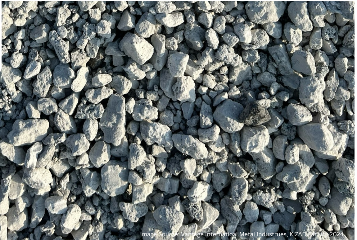
Image Source: Vantage International Metal Industries, KIZAD Facility, 2024

Vantage International Metal Industries LLC stands at the forefront of technological innovation with our advanced cryolite production, a pivotal component in the aluminum smelting process. Cryolite acts as a solvent for Bauxite, playing a critical role in the extraction of aluminum through the Hall-Héroult electrolytic process. Our state-of-the-art production facilities employ rigorous quality control measures to ensure the highest standards of purity and particle size distribution in our cryolite offerings.