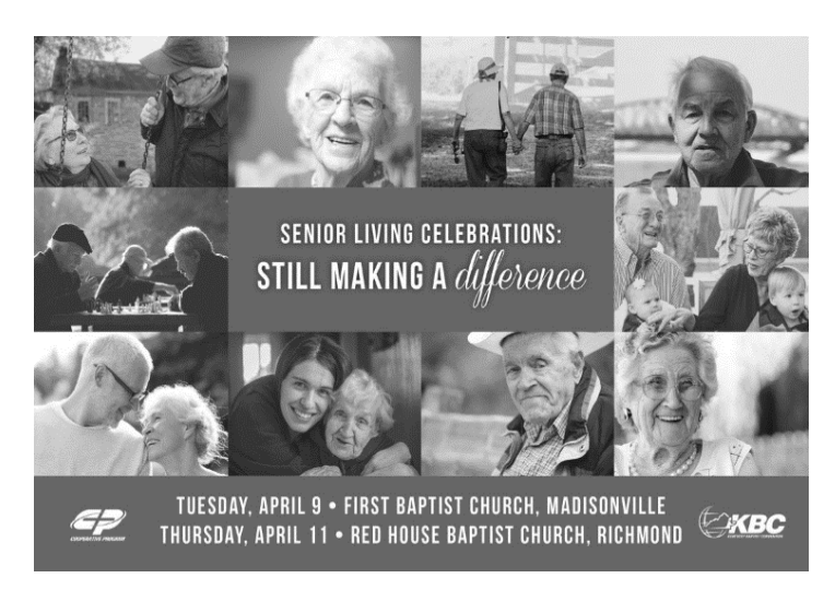
Register at: http://www.kybaptist.org/stories/senior-living-celebrations,2260 Early Registration by April 3, $20; After April 3, $25

Anyone interested in going can find more information on the website: www.kywmu.org.