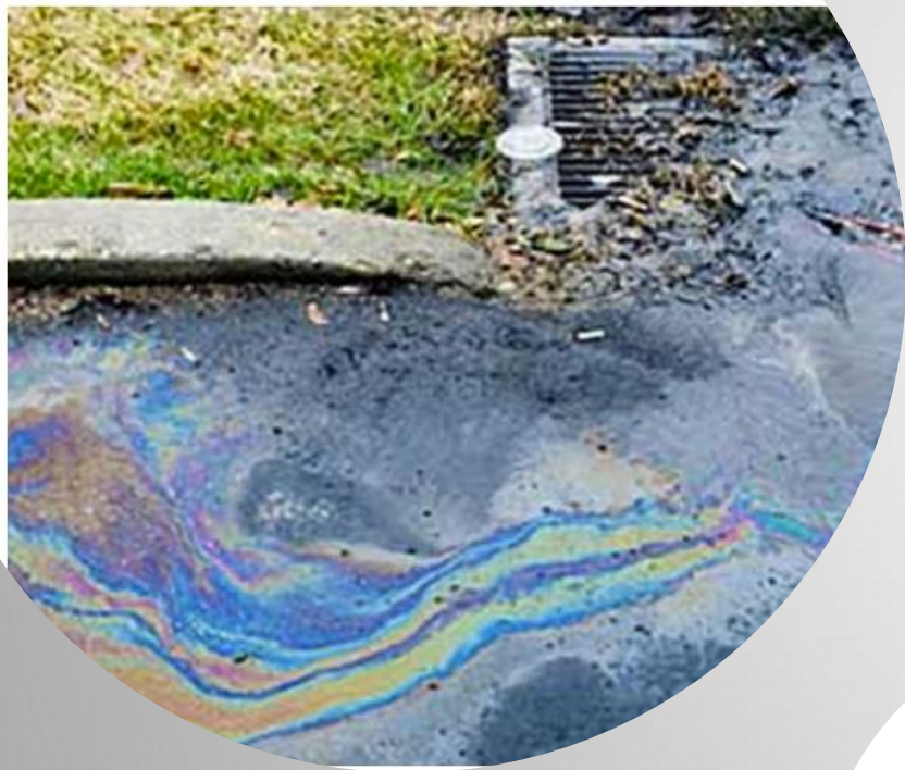
Millers River Watershed Council, MA