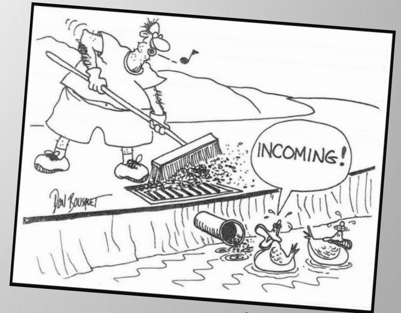
Antrim Township, PA