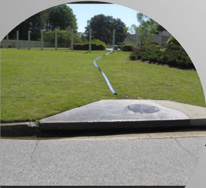
Fayette County, GA