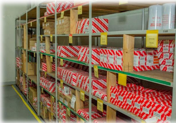
Toyota Genuine Spare Parts