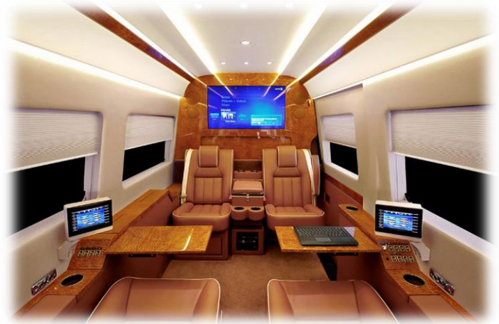
Executive Van Office