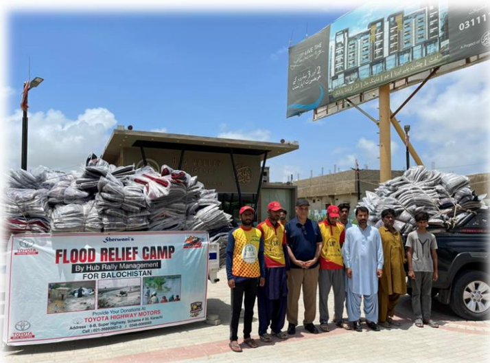
Distributed blankets & ration in the flood 2022 affectees of Balochistan.

Being socially responsible is an integral part of Sherwani Motors business values. From past 29 years Sherwani Motors has been regularly conducting CSR activities and contributing in community development.