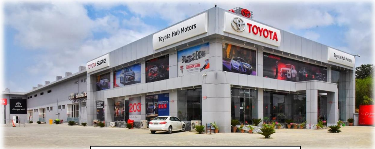
Toyota Hub Motors (State of Art Dealership)