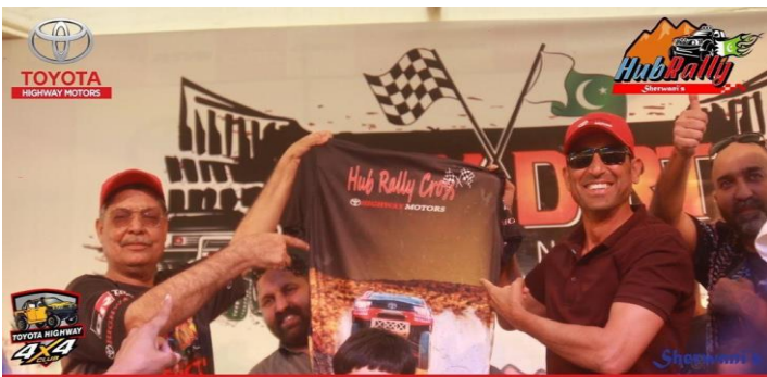
Cricket Legend Younus Khan At 4th Hub Rally 2017