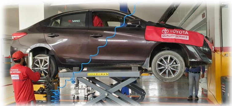
Toyota Quality Service