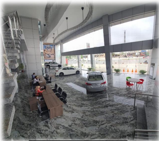
Sales & New Car Display