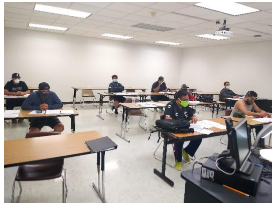
Contractors and construction workers refine their blueprint reading and interpretation skills

The mission of the Latino Chamber of Commerce of Southeastern Wisconsin Inc. is to foster the economic development of Wisconsin by advocating, strengthening, and promoting the growth and development of Latino and other minority and emerging enterprises with the goals of providing increased access to capital, business opportunities, job creation, and capacity building programs. For more information,