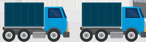
Ex. Fleet Management