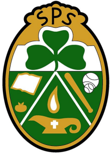
SPEV Open House: Tuesday, November 15 th 2022