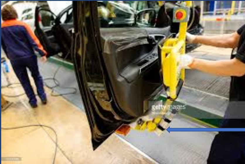
Power Supply Switch

X-tractor enables one to perform in-line and end-of-line QC testing on a factory floor.