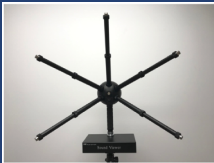
Sound Viewer — A one-of-a-kind comprehensive noise diagnosis and analysis system