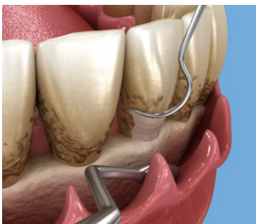
Deep Cleaning under the gums

ACT EARLY. If left unaddressed you may need: