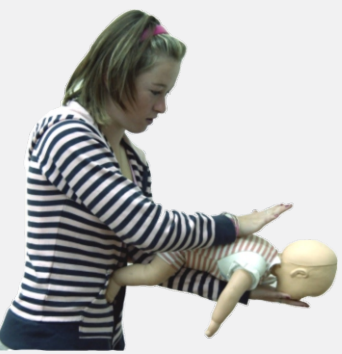
This is one method for infant- if having to act quickly where no seat is available to allow for positioning over the first aiders thigh.

Infant: Back blows - head downwards so gravity will assist with expulsion. Across your lap/thigh or over your arm. Chest thrusts – turn over.