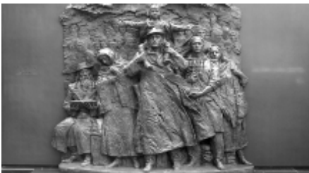
Frontal View of Shanghai Refugee Memorial

For the Jewish Shanghaianders the sentiments towards the Japanese are much more complex. While the Japanese were stern overlords and produced edicts that made Chinese and Jewish lives in Shanghai more difficult, the Jews have not forgotten that the Japanese government chose to ignore German requests that Jews be