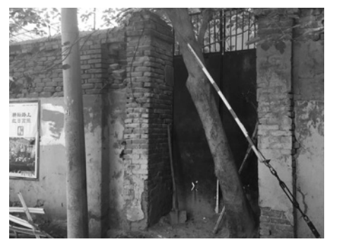
(Gate in disuse, location of front gate of the synagogue when it existed)

According to our research we should be near the site of an ancient synagogue, the oldest and most colorful place of Judaic worship in all of China. The building is described in Pearl S. Buck's novel Peony as well as mentioned countless times in diaries of early missionaries. Some even recorded its magnificence in paintings and drawings. However, at this particular moment, all we see around us is derelict plastered walls, barred windows and locked gates.