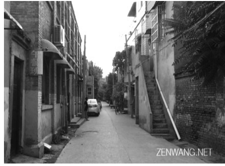
(North Teaching the Holy Text Alley)

Continuing on the alleyway southward we meet only a few people. Remembering the advice from our taxi driver I choose only to speak to old folks. "Do you know of any Jews that lived here?" I ask an old man sitting on a tricycle. A brash wave is all I get in return before he