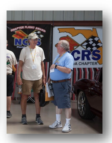
Lunch is served!