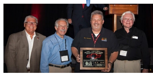
National Convention Palm Springs 2021