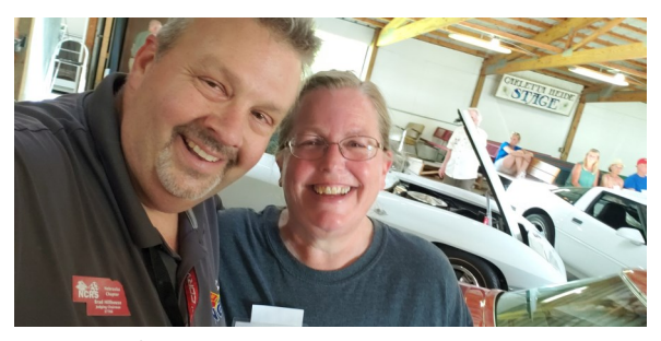
Wisconsin Chapter Meet 2021