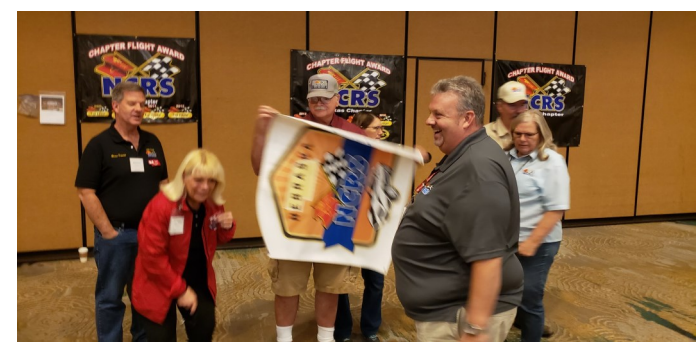
National Convention Palm Springs 2021