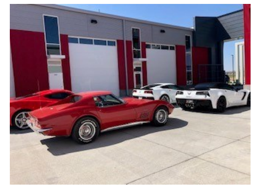
Victory Lane 2021