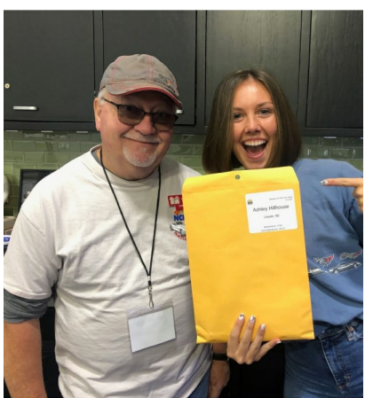
Last Blast 2021