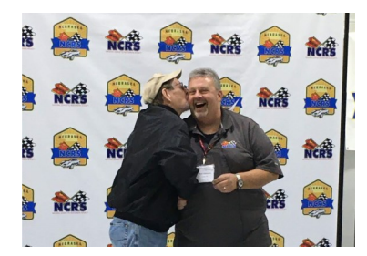
Last Blast 2021