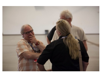
Heartland Regional 2021