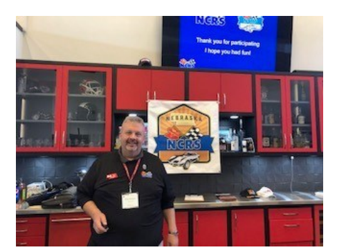
Spring Judging Meet 2021

When someone asks me what is NCRS? Or what do you do in NCRS? Well, these pictures answer those questions!