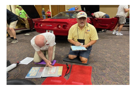
Lone Star Regional 2021