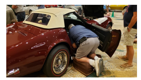
Lone Star Regional 2021