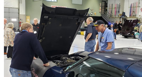
Last Blast 2021